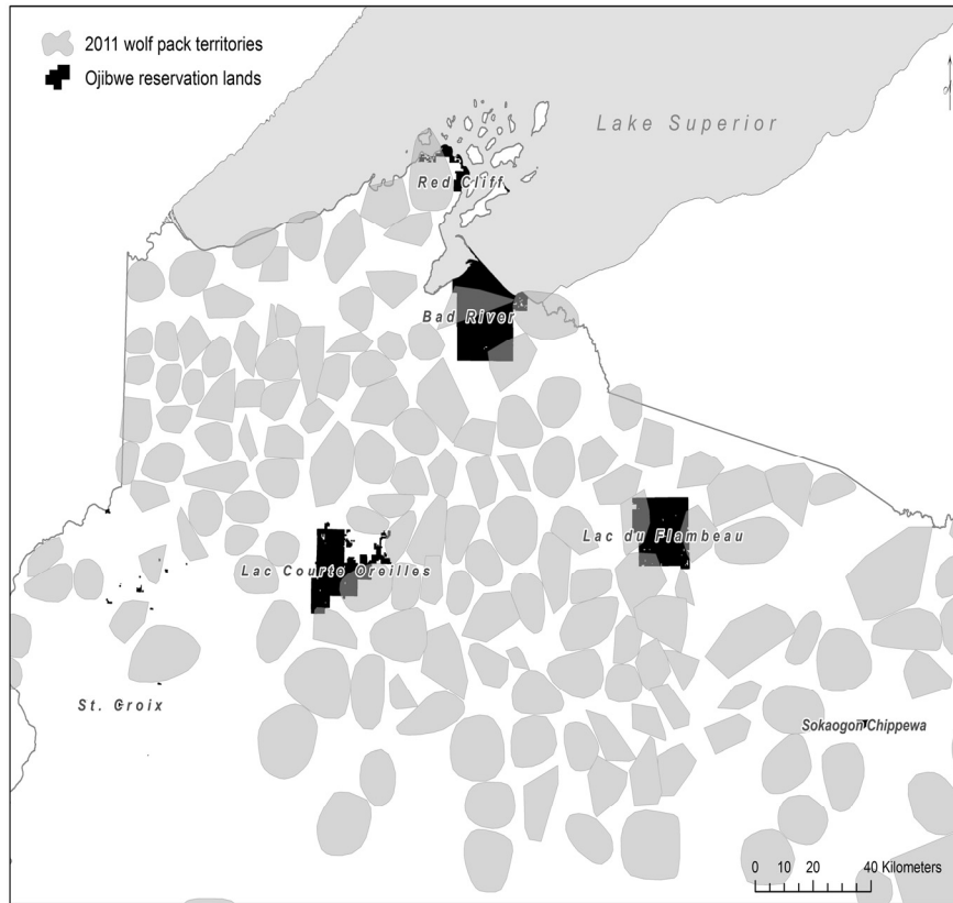
DIAGRAM 1—WOLF PACK TERRITORIES AND RESERVATION BOUNDARIES 139

Olson’s research concludes that “a buffer area adjacent to Ojibwe reservation land would be essential to protect wolf packs whose territory overlaps with non-reservation land. However, which wolf packs should be targeted and the delineation of the buffer area to protect those wolf packs would be up to the State and the Tribes.” 140